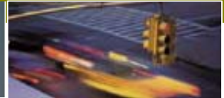
Photo Enforcement Program Monthly Executive Summary